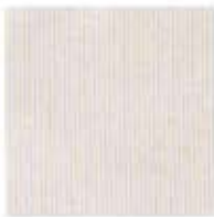
Tissue Faille Cream