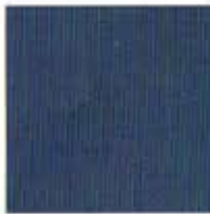
Tissue Faille Teal