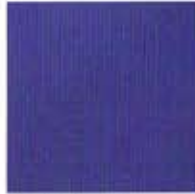
Tissue Faille Royal