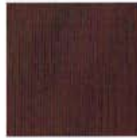
Tissue Faille Claret