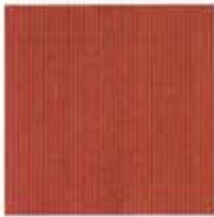
Tissue Faille Red