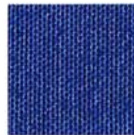
Liberty Royal Blue