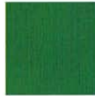
Liberty Emerald Green