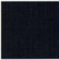
Tissue Faille Black