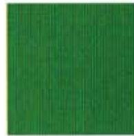
Tissue Faille Green