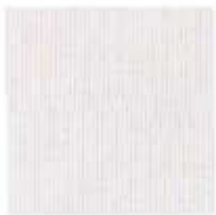
Tissue Faille Pale Yellow