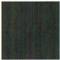
Tissue Faille Evergreen