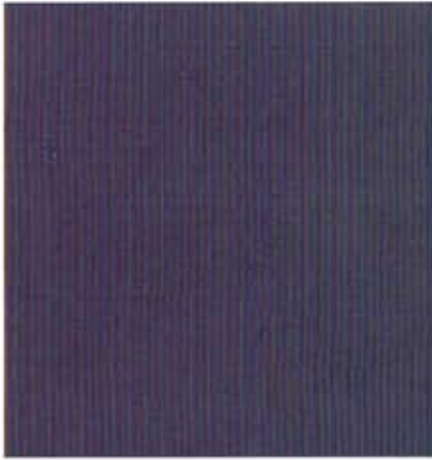
Tissue Faille Navy