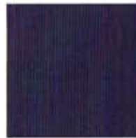
Tissue Faille Purple