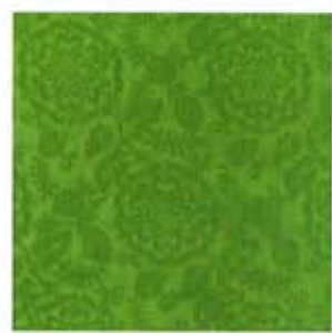
Tudor Rose Bemberg Green

DAMASK SILK 100% Damask Silk Main Uses: Stoles and Panels