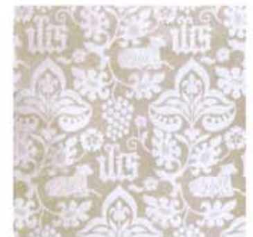
Damask Silk White Agnus Dei