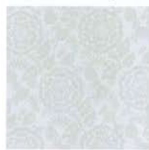
Tudor Rose Bemberg White