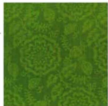
Damask Silk Tudor Rose Green