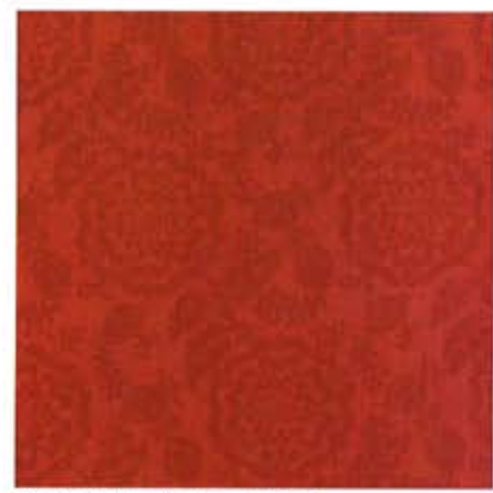
Tudor Rose Bemberg Red

TUDOR ROSE BEMBERG 100% Rayon Damask Main Use: Stoles and Panels