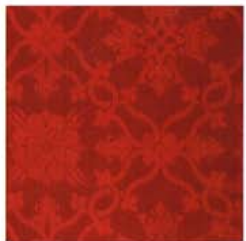
Damask Silk Red Ely