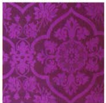
Damask Silk Purple Normandy

DAMASK SILK 100% Damask Silk Main Uses: Stoles and Panels