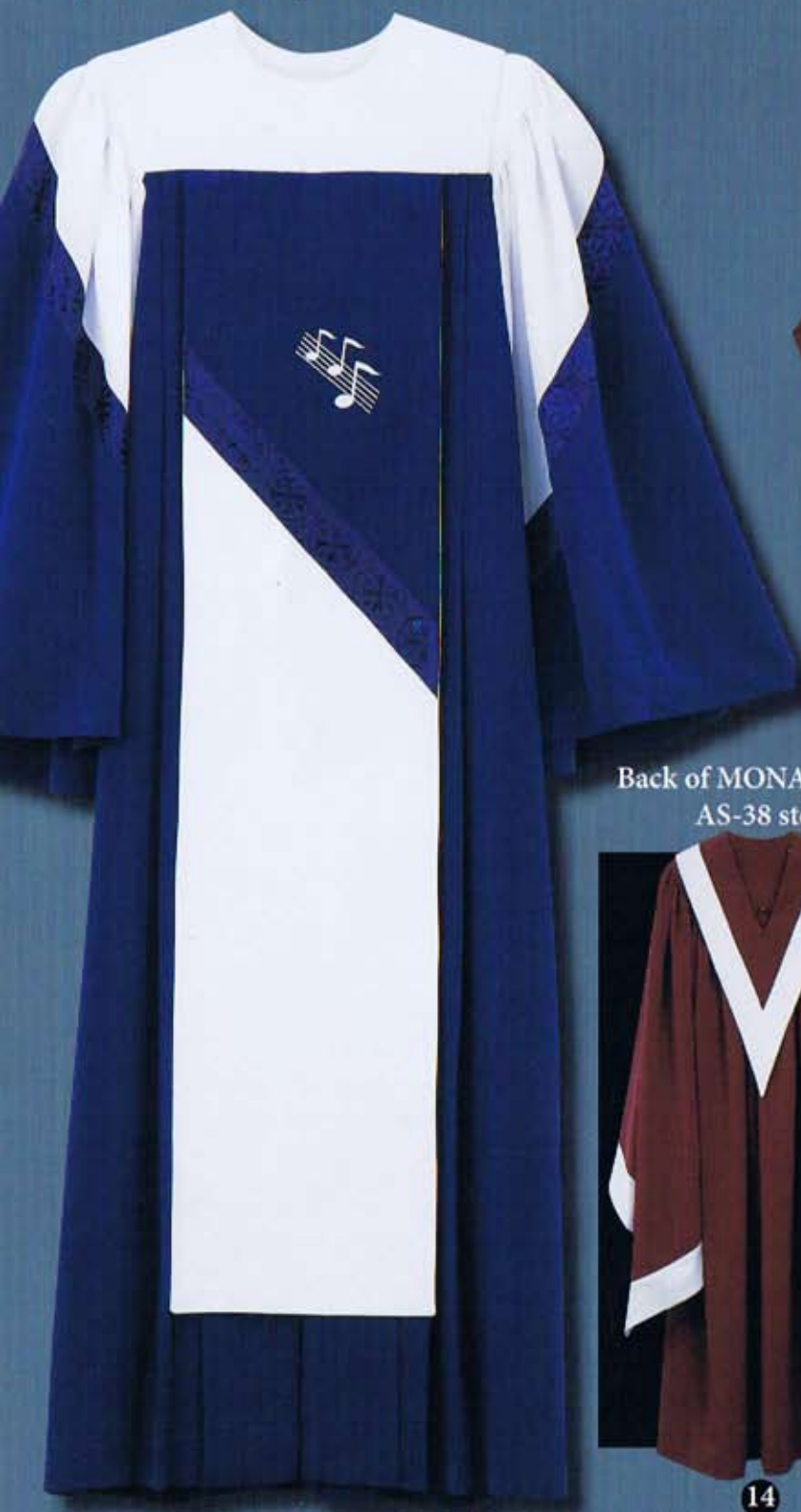
Back of MONACO with AS-38 stole

A complete ensemble with contrasting colors on upper sleeve, yoke and lower half of attached tunic. A custom fluted gown, it features a double "cross over" yoke with velcro closure. Coordinating or contrasting band made from patterned fabric to highlight the division of colors. Embroidery appropriate on attached tunic or yoke. Gown has open sleeves.