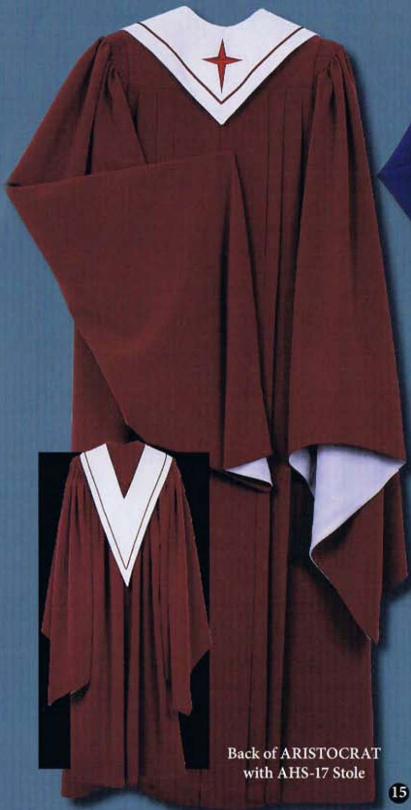
Back of ARISTOCRAT with AHS-17 Stole

A graceful contrasting sleeve lining extending half-way up the inner sleeve adds interest and distinction. This gown has custom fluting over the back and shoulders to the distinctive front pleating. Shown with AHS 17 stole with coordinating color braid and embroidered cross. Stole and embroidery priced separately.